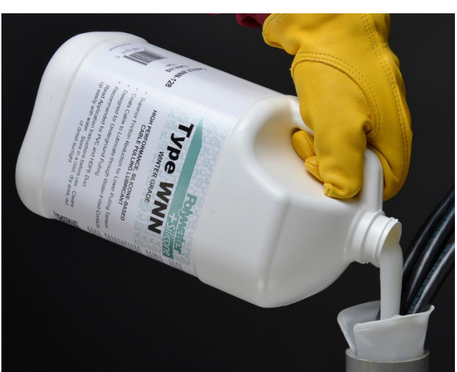
Polywater + Silicone Lubricant is easy to pump or pour into conduit

Coefficient of friction data on additional or specific cable jackets or conduits can be obtained from American Polywater Corporation.